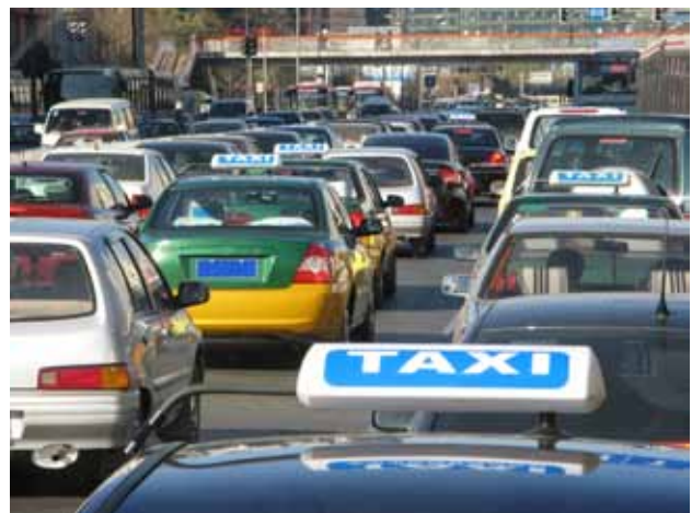
HBEFA China can calculate emission impacts of traffic congestion

It is feasible to design effective measures for less polluting urban transport systems. This requires, however, understanding of the drivers of emissions i.e. which vehicles are on city roads, which and how much fuel do cars and buses consume, in what traffic situations vehicles emit less than in others and accumulating data on the total kilometres travelled by each vehicle type.