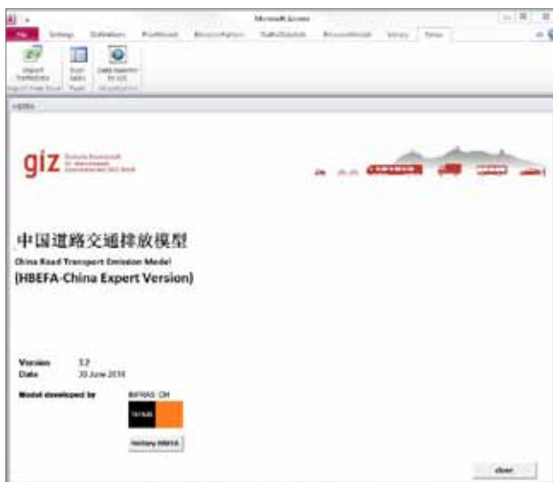
Start screen of CRTEM/HBEFA China

stop-and-go traffic. Almost non-existent in Europe, heavy stop-and-go situations make up 5 – 10% of urban traffic in China's large metropolises. This matters because cars emit significantly more in highly congested traffic – up to three times more than in free flow situations.